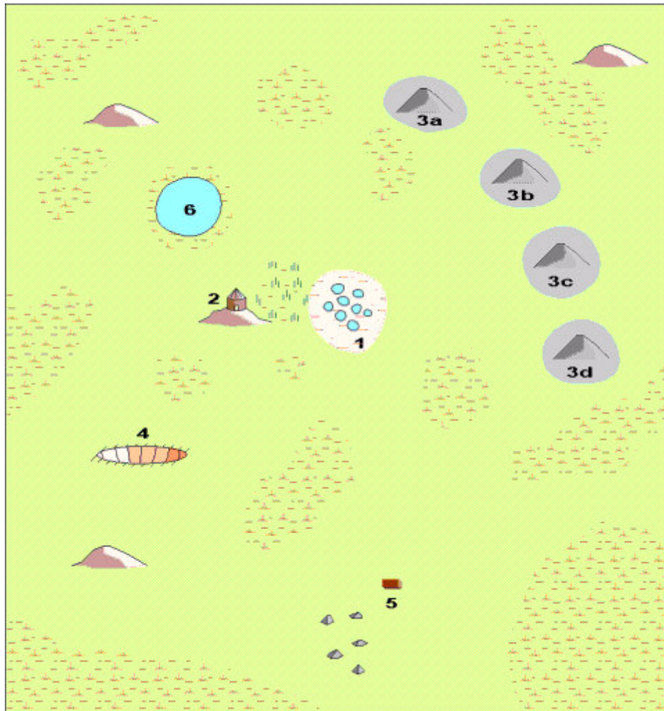
Figure 1. The hot springs and surrounding terrain features.

Beneath the bottomless bogs, in the vicinity of the hot springs, is a secret so ancient that it has been all but forgotten. A magical construct of immense size and formidable power is buried so deeply beneath the marsh that only a few traces of the artifact can be observed. These effects include the hot springs themselves, a result of the magical energies seeping from the construct and intermixing with the ground water.